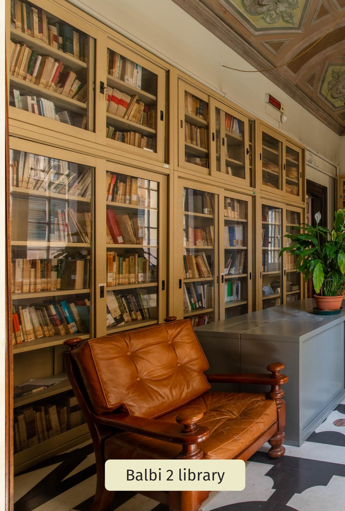
Balbi 2 library

Each year, in collaboration with Foundation Palazzo Ducale, UniGeSenior organize conferences about specific topics, involving great personalities and experts.